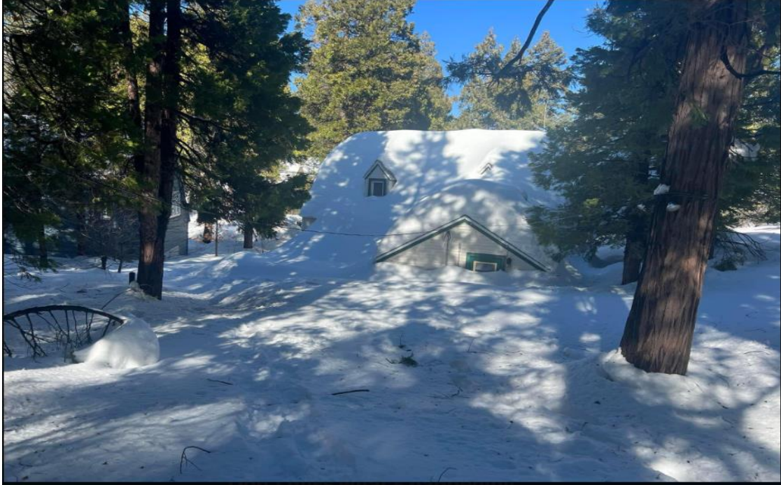
Figure 1: Heavy snowfall in Crestline, CA on March 3, 2023.

At the peak of the Late Winter Storms event, there were 70 road closures. As of March 27, 2023, 30 of the 70 roads that reported closures have no estimated time of reopening. Currently impacted routes include US Highway 395 in Mono and Inyo counties, State Route (SR) 18, 138, and 330 in San Bernardino County; SR 1 in Monterey, and San Luis Obispo counties; US Highway 101 in Santa Clara County; and Interstate 80 from Colfax, California to the Nevada state line. Routes such as US 395 have been closed for weeks due to snow and ice and still have no estimated time of reopening.