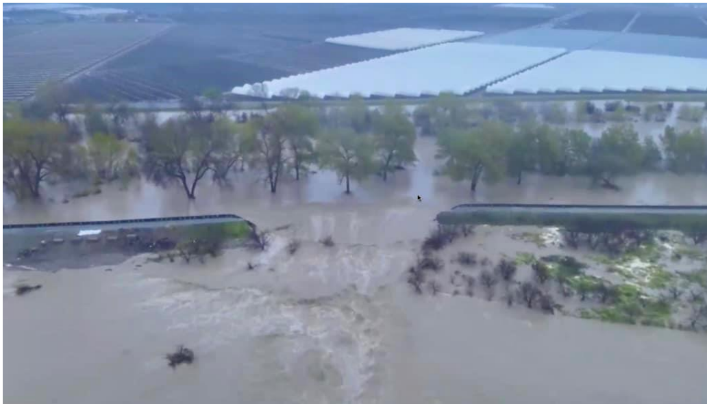
Figure 1: Levee Breach in Pajaro, CA caused catastrophic damage to homes on March 11, 2023

The effects on the population of Monterey County remain significant as the county is also considered highly vulnerable to recent disaster impacts, ranking in the 82 nd percentile for overall social vulnerability. Because the impacted communities have a relatively low median household income and a high percentage of renters, many individuals and households are subject to an increased vulnerability to displacement.