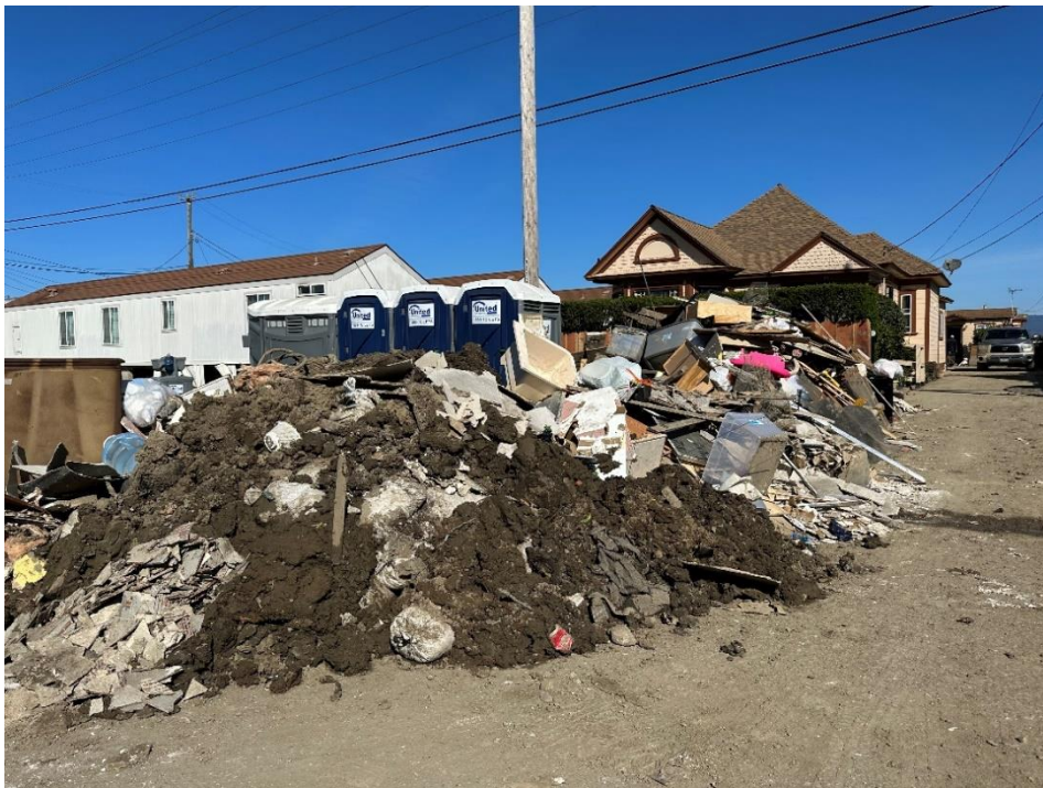
Pajaro, Monterey Residential Debris Recorded March 27, 2023

In Monterey County, approximately 44% lack homeowner's or personal property insurance and less than 5% have flood insurance. IA Joint-PDAs report 200 homes have suffered major damage or have been destroyed. However, many more properties are predicted to be affected or damaged given projected river flows and ongoing storms. In addition, Monterey County is reporting agricultural losses exceeding $450.5 million. As one of the largest producers of produce in the United States, the economic consequences of this disaster will heavily affect the local economy and thereby the State economy.