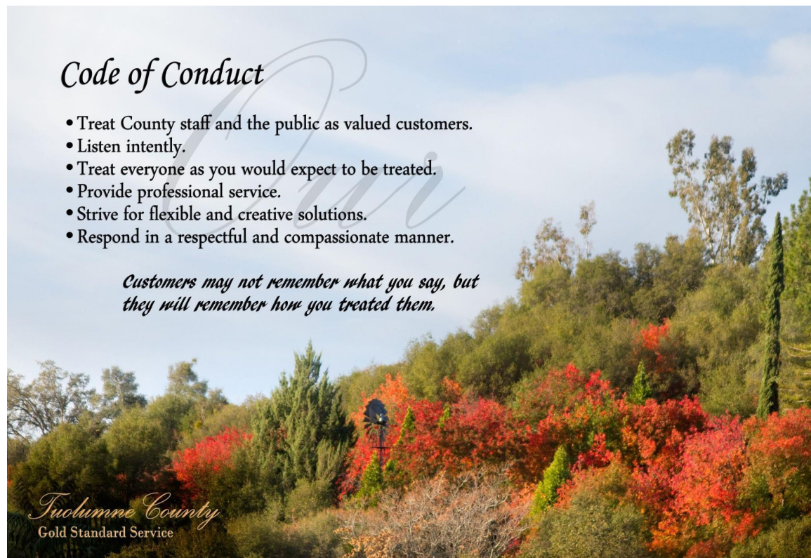
Figure 4. Code of Conduct on website January 28, 2022

The Institute for Local Government states that legal requirements are minimum standards for ethical conduct—a “floor for conduct, not a ceiling”. 39 AB 1234 training describes universal standards for ethics that suggest a higher standard for conduct, including responsible behavior that promotes the best interests of the public and community and does not waste public resources.