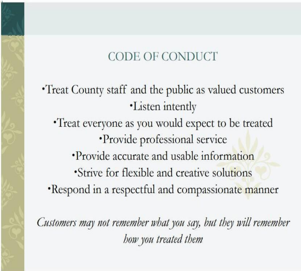
Figure 3. Tuolumne County Code of Conduct 37

The Grand Jury discovered that a new Code of Conduct was posted on the County website on January 28, 2022 (Figure 4). This is identical to the one adopted in 2011 which still exists on the County website’s list of documents, with the exception that it omits the statement: “Provide accurate and usable information”. 38 Since no document control system is used by the County, it is not possible to know if the change is intentional or an oversight. It is clear from the postings on the County website as well as posters in County facilities, however, that the changed Code of Conduct is now considered to be official whether the change was intended or not.