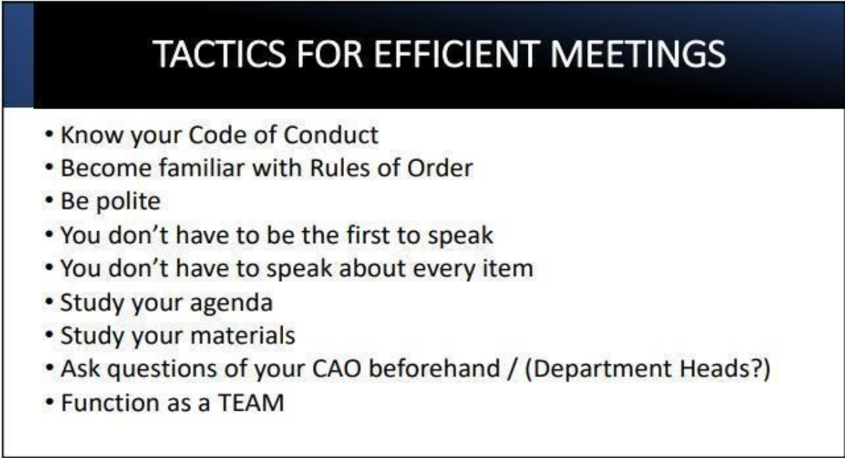
Figure 2. Tactics for Efficient Meetings 31

Inefficiency and inconsistencies in the procedures and process of Board meetings creates an opportunity cost, may contribute to public confusion on important issues, and delays action on other priorities. This investigation revealed that several previous Boards of Supervisors did not direct actions to correct outdated safety documents, nor did they address staffing gaps in roles vital to employee and public safety. The California State Association of Counties (CSAC) has suggestions for efficient meetings (Figure 2). The Grand Jury observed ways in which the Board could have benefitted from these suggestions. The Grand Jury also observed instances where the Board failed to follow three of the listed tactics: know your Code of Conduct, become familiar with your rules of order, and ask questions beforehand of the CAO and department heads. 30