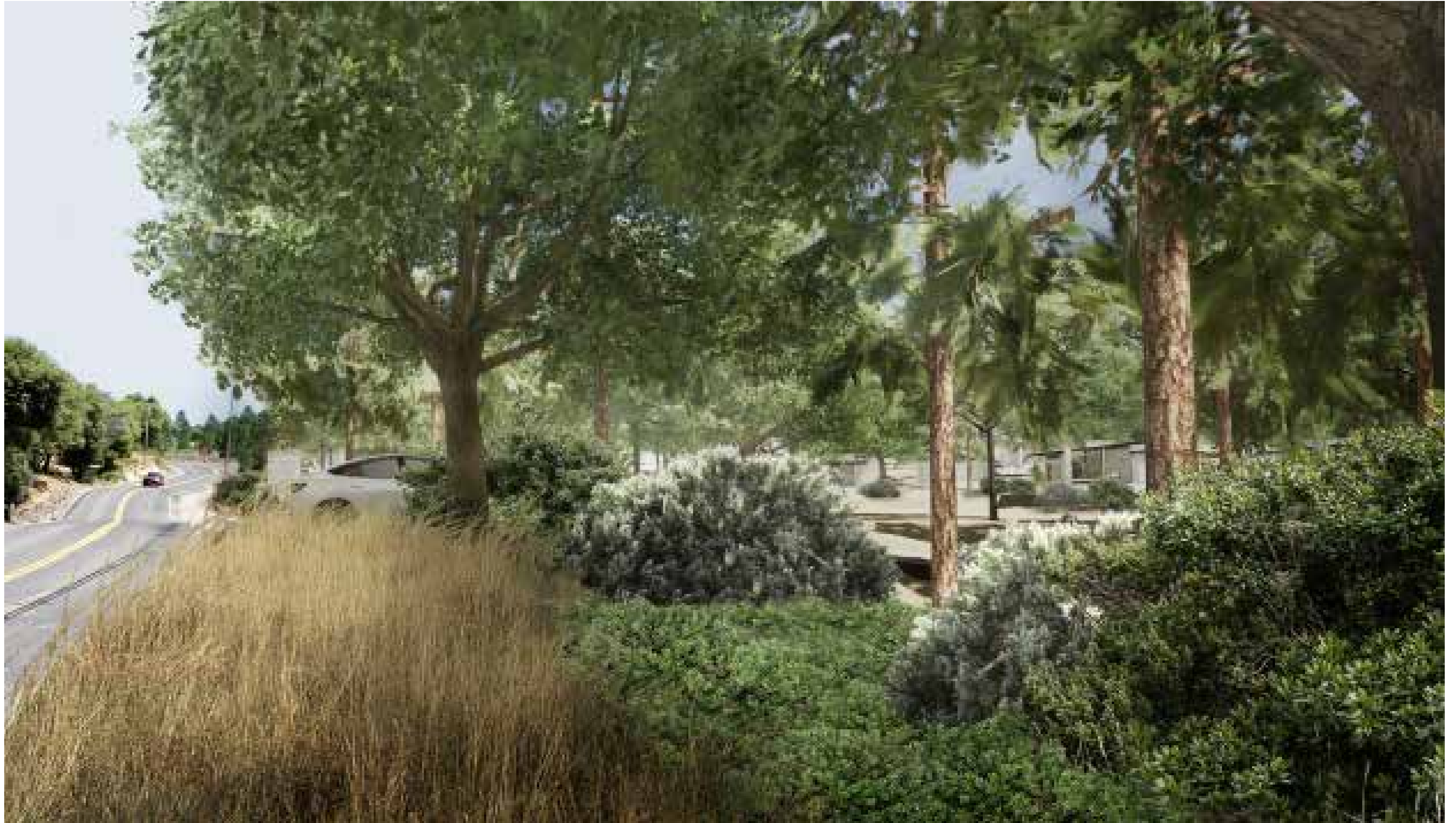
PROPOSED PROJECT 20 YEAR VISION