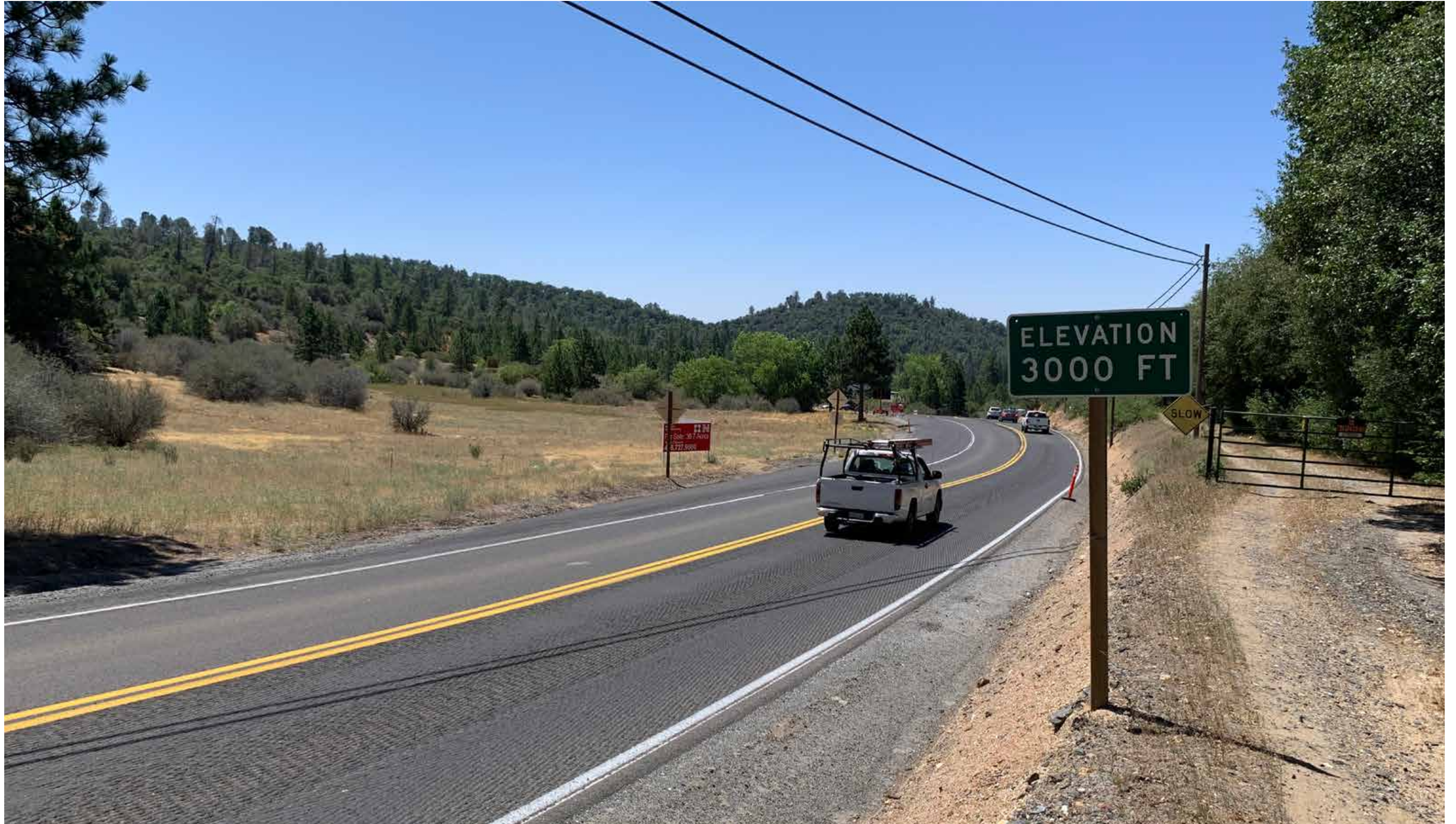
CURRENT CONDITION STREET VIEW FROM WEST BOUND HWY 120