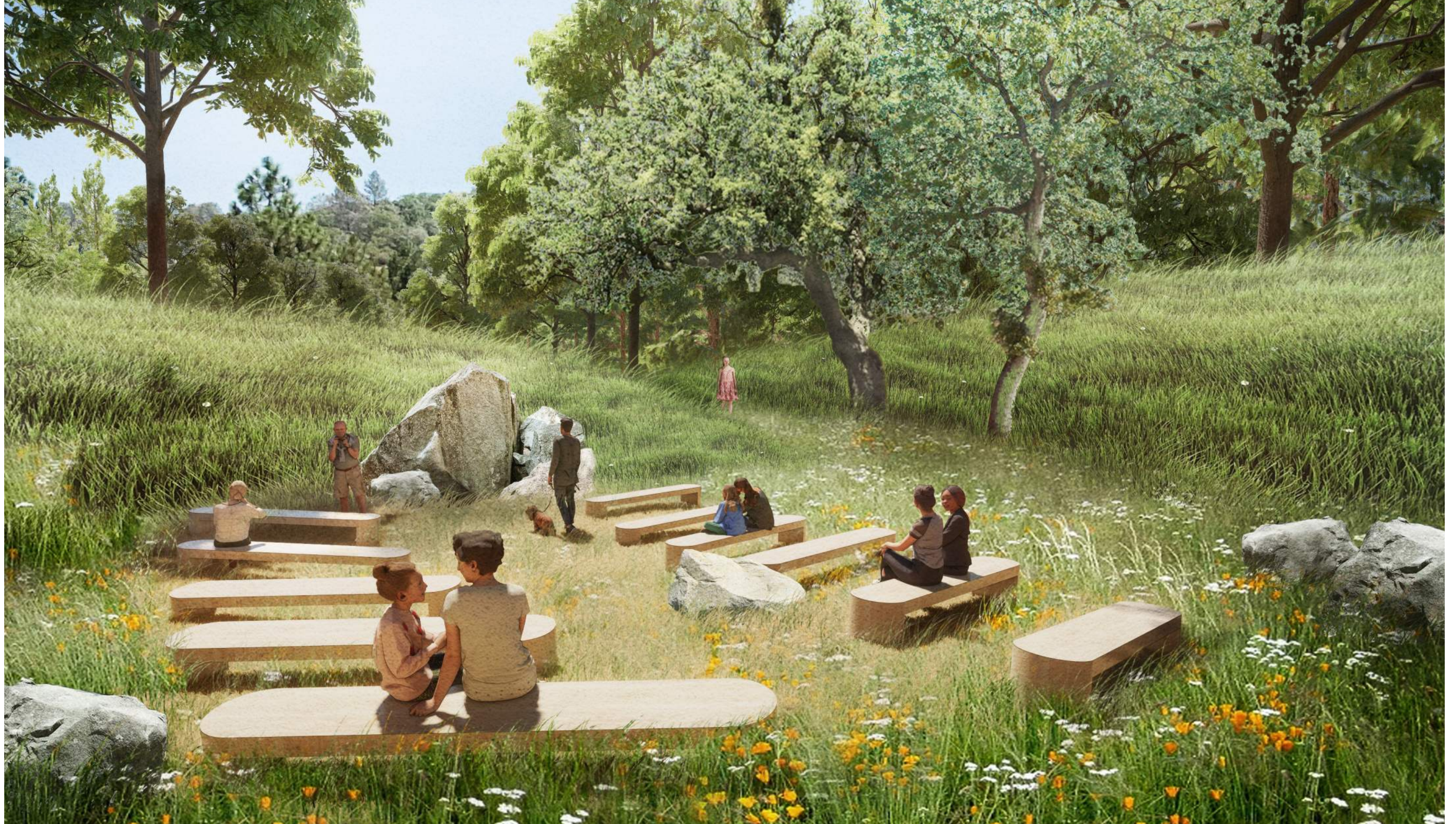
PROPOSED PROJECT 20 YEAR VISION