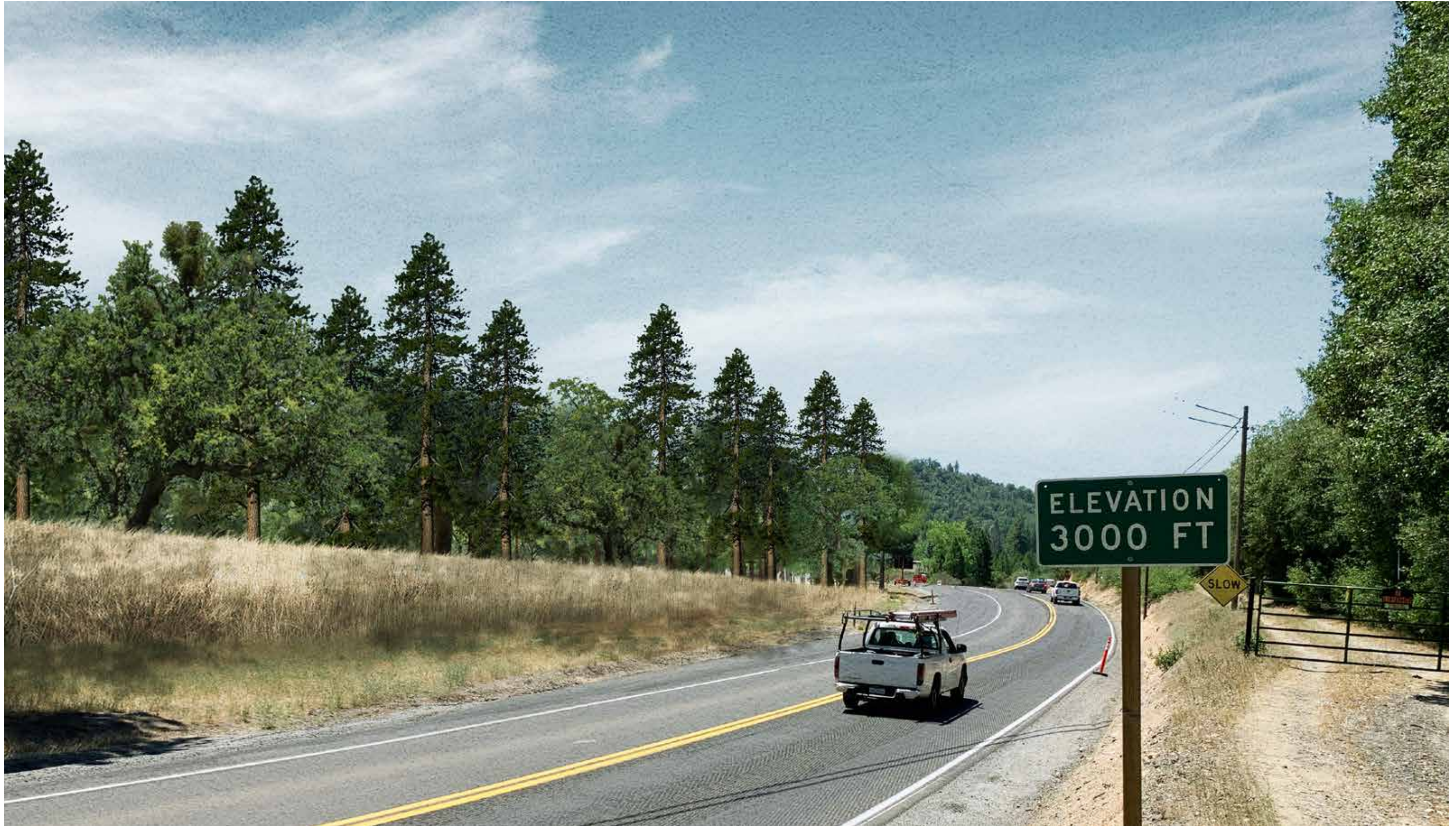
PROPOSED PROJECT 20 YEAR VISION