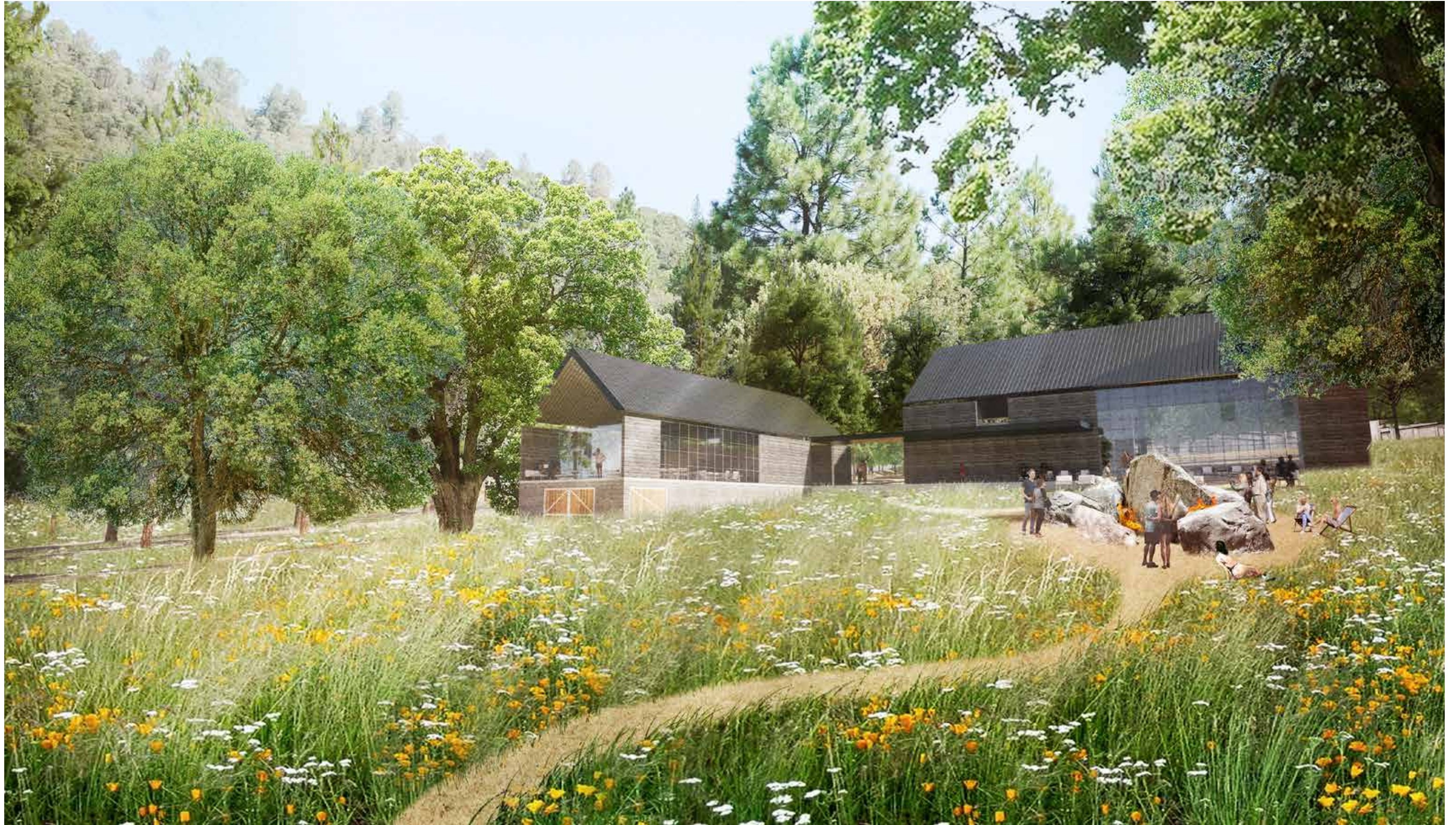
PROPOSED PROJECT 20 YEAR VISION