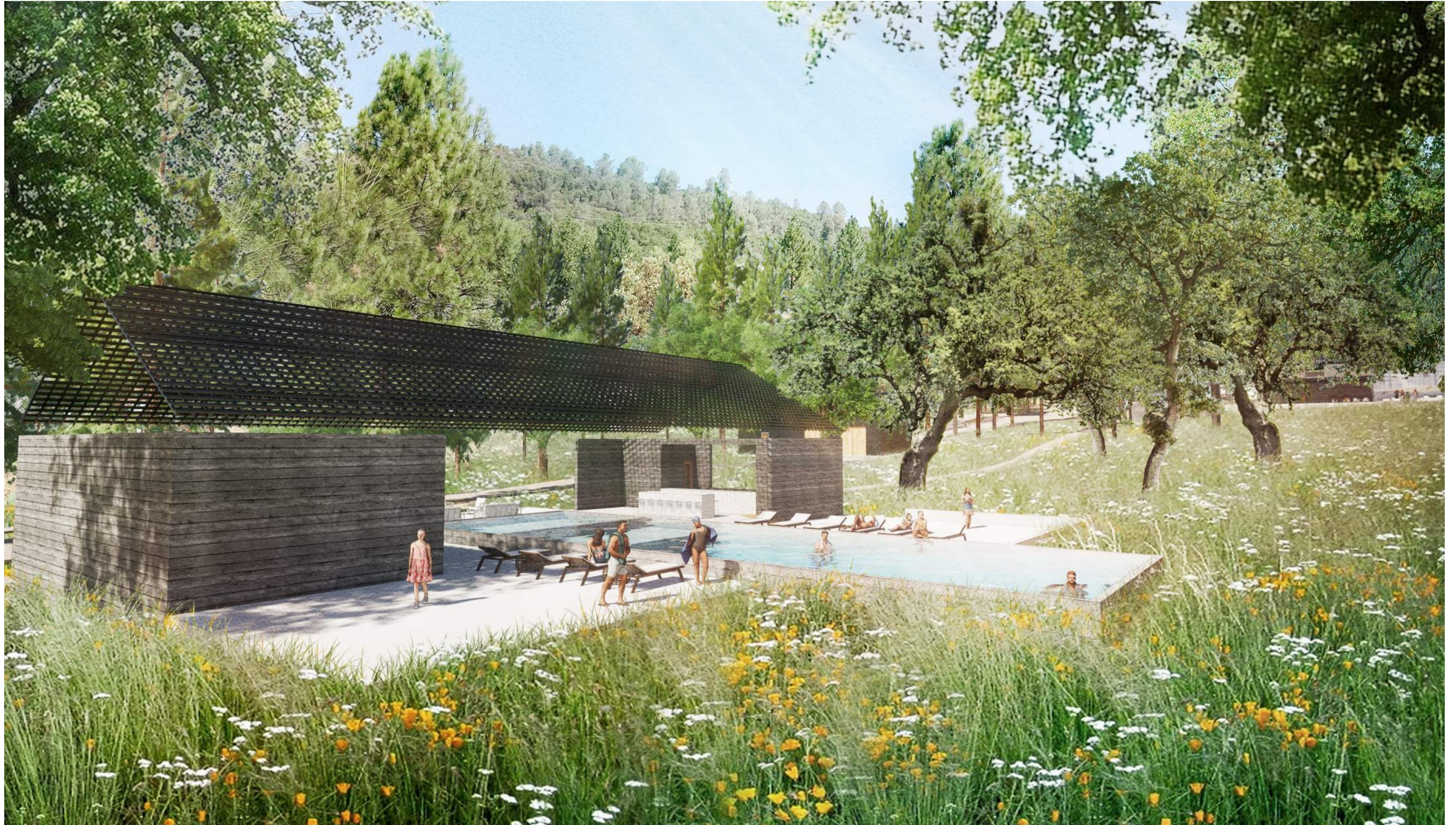
PROPOSED PROJECT 20 YEAR VISION