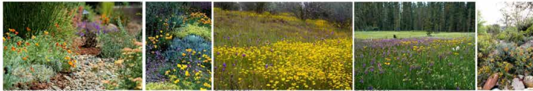
PRELIMINARY LANDSCAPE CHARACTER