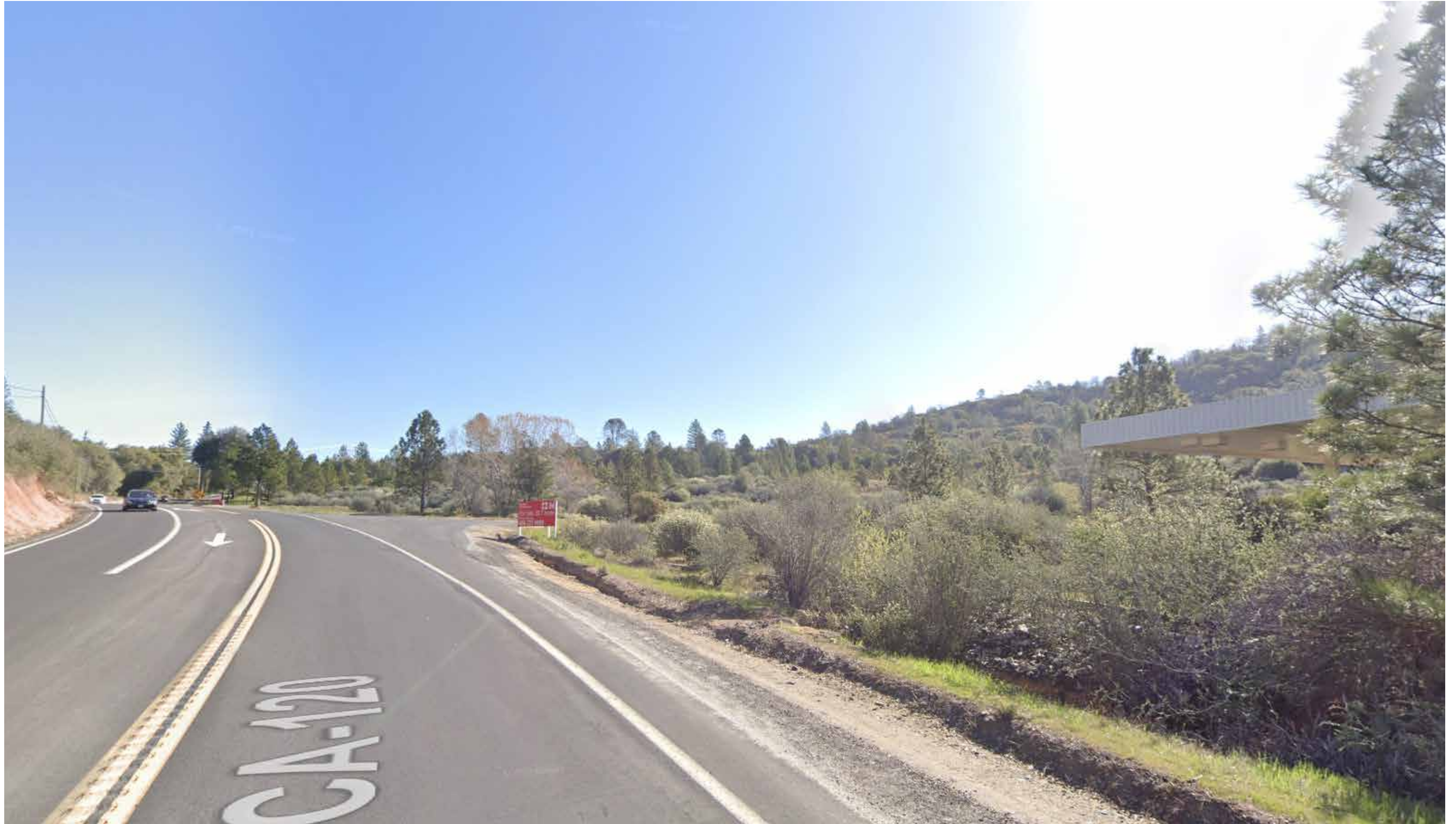
CURRENT CONDITION STREET VIEW FROM EAST BOUND HWY 120