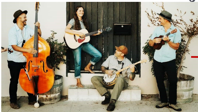
High Country Chimes