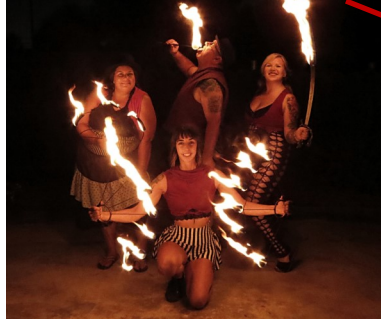
Fire Show at 8:30 pm!