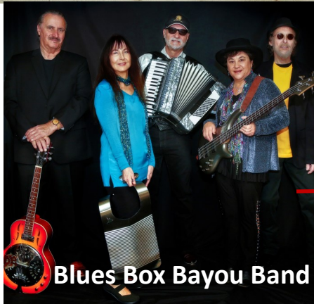
Blues Box Bayou Band