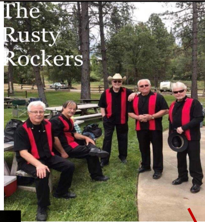
The Rusty Rockers